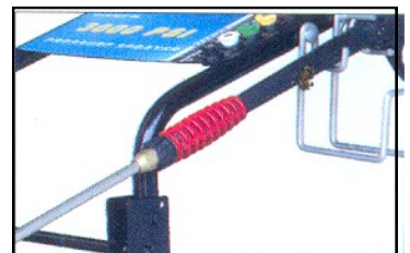
A heavy duty pressure gun with a stainless steel spray lance with bayonet mountings are supplied as standard.

KleenMaster High Pressure Cleaners are manufactured to be the most heavy duty and durable on the market. Only low speed (1450 rpm) class F electric motors are used. They are coupled to a super long life pump heads. All components in contact with water is in stainless steel or brass. Hoses and attachments are mounted with quick release couplers for ease of use and durability.