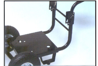
KleenMaster high pressure cleaners are mounted on to sturdy heavy duty steel chassis that has folding handles and are powder coated for durability