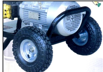
KleenMaster high pressure cleaners are mounted with large pneumatic tires for easy & smooth movement over uneven surfaces.