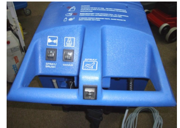
Ergonomic handle design with fingertip controls