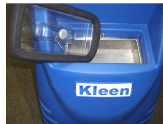
Easy 'no-spill' fill opening with stainless steel sieve. Large 28 liter tanks