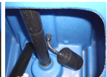
Hi-tech Electronic Float to prevent overflow with clear recovery tank dome