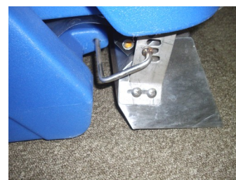
Adjustable brush setting for cleaning carpets of different pile heights