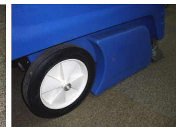
Large 10" non-marking wheels for quick and easy movement of machine